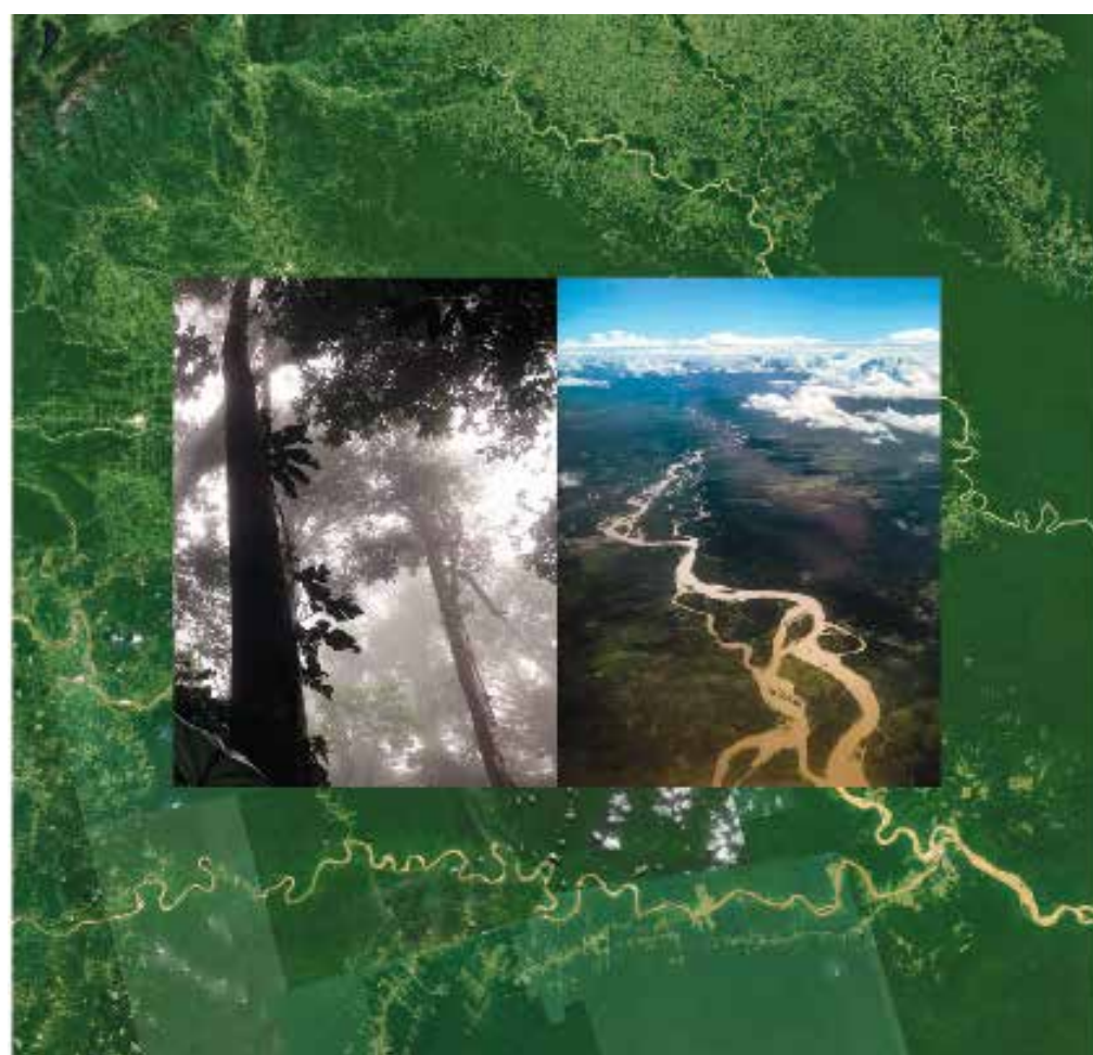
Felipe Castelblanco, Amazon Library / A Vertical Territory from Cartographies of the Unseen , 2021, Silkscreen, 50 x 70 cm